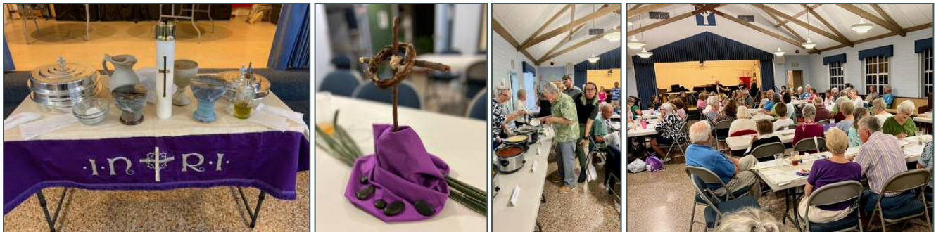
From left to right: Communion table with ashes; beautiful centerpieces; members of Fellowship Committee serving soup; a large crowd in attendance for physical and spiritual nourishment.